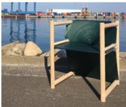
The dinner chair