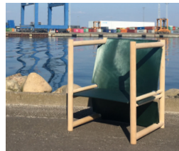
The lounge chair