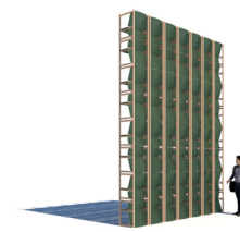
Pavilion wall of chairs